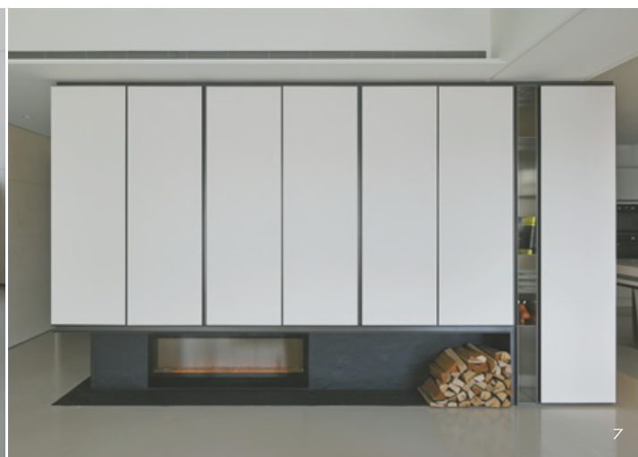
3.4. 從客廳望向後方的餐廳空間，天、地與立面的純色對比中，就像由色塊形成的抽象畫作。5. 客廳的收納櫃向後方餐廚空間延伸，為兩個機能單位帶來一種延續感。6. 訂製的不鏽鋼機櫃是客廳影音設備的收納處，金屬俐落輕盈的質感，與純淨白色立面融合。7. 一反多數住家空間所喜愛的收納功能與木皮、木作，從玄關連綿到餐廳的櫃體是住家最重要的收納空間。櫃身以白色皮革為材料，收邊則以木頭噴上金屬漆處理，簡約而雅致。 3.4. A dramatic view, dominated by the sharp contrast of colors, from living room towards the dining room 5. Living room cabinet creates a visual extension from the living room towards the dining room 6. A stainless steel box stores audio-video equipment 7. Cabinet details show unusual details, very much different from typical wood work craft manner and detail

空間中，李智翔為呼應屋主對簡約風格的傾向，於是便在黑灰白三種純色範疇中，利用石材、皮革、採礦岩、灰色手工漆或大理石去創造立面，藉由單一材質去展現立面紋理與線條方向性，同時各色家具陳設也以輕量化為概念，避免厚重質量影響了立面純粹氣息。其次，隨屋體放達為開闊平面、臨窗走道能完善吸收戶外光源，光影對立面形成的關係也是設計所企圖捕捉的。