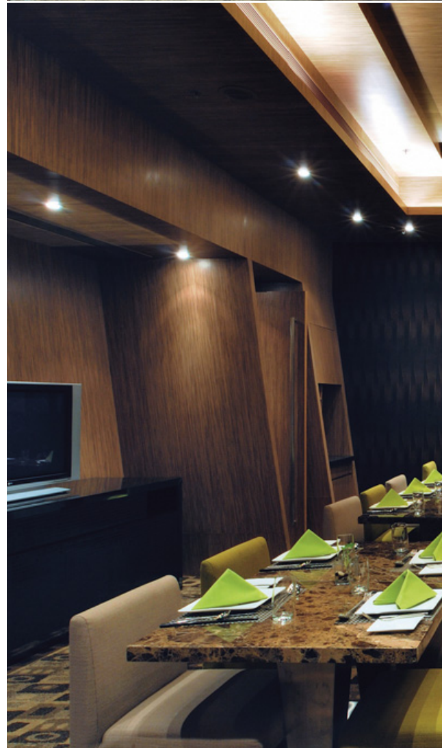
6. 酒店大廳平面圖。7. 咖啡廳與家具配置圖。8. 走道與餐廳區的關係。9. 在這裡我們可以看出天花板是弧形的、傾斜的。10. 看看，左右的牆面不是形成對稱的角度。11. 咖啡廳入口，酒櫃也是利用斜角製造趣味。 6. Lobby plan 7. Café and its furniture setting 8. Pathway and restaurant 9. Bending and slanted ceiling panels 10. Asymmetrical layout of the lobby 11. A view towards the café; a wine cabinet looks distorted