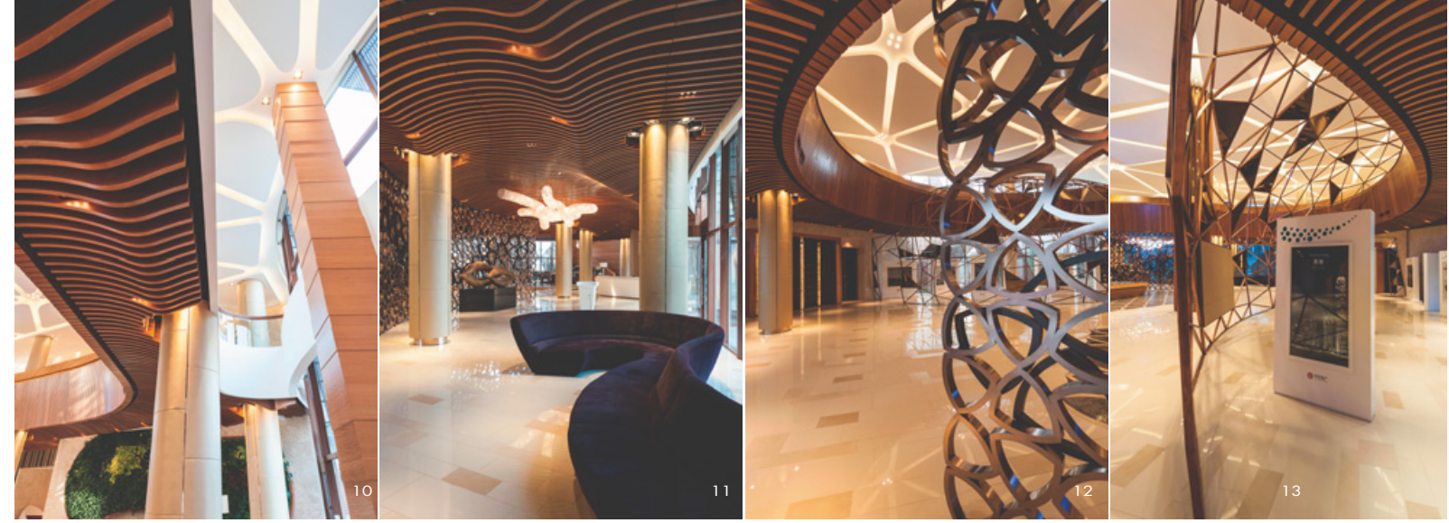
9. 立體雕塑般的天花，充分傳達了設計者營造的藝術創意。10. 挑高的大廳結構與大量木作所打造的氛圍。11. 屏風分隔了洽談區和休憩區。12. 天花板內置燈槽，將燈光轉化為空設計元素。13. 展示區。14. 金屬鏤空的屏風，搭配璀璨的水晶燈，倍感華麗。 9. Ceiling pattern exhibits a unique beauty like an art piece 10. Eight-meter high grand hall is structured with a timber framework 11. A metal screen divides the discussion and rest areas 12. Light fixture groove hidden behind timber members 13. Showroom 14. Metal screen and chandelier give the space a luxurious impression