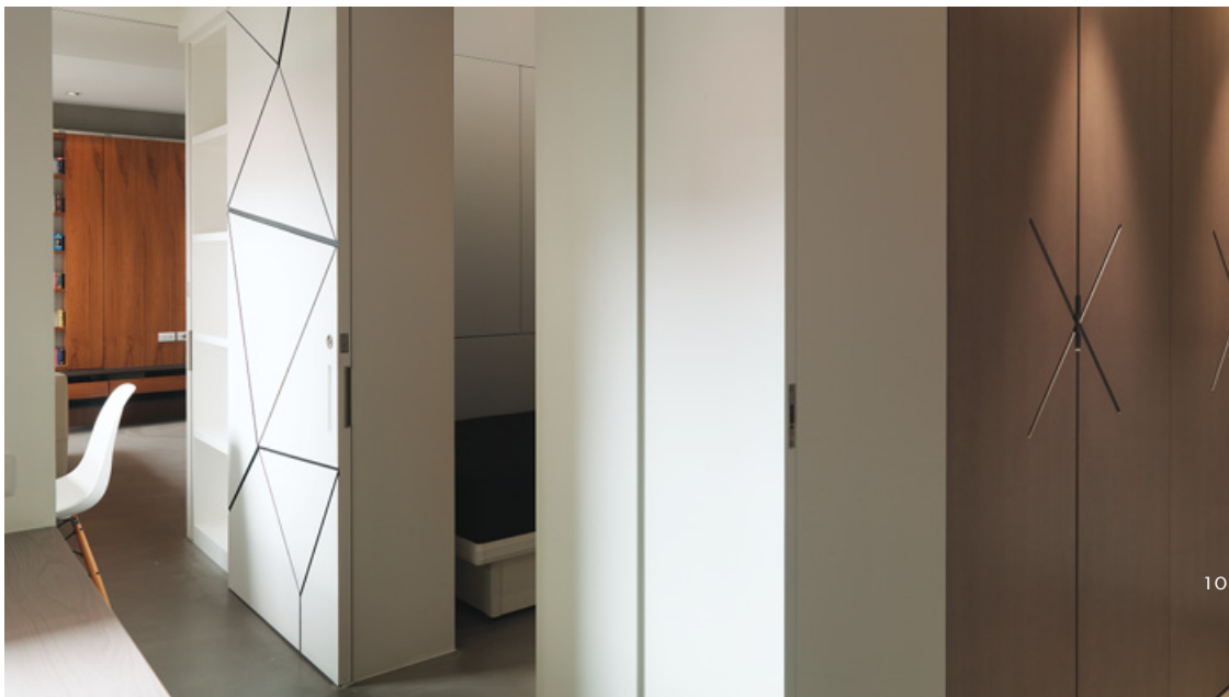
8. 男孩房區的共用書房，創造討論課業與生活的交流小廳。9. 客廳主牆兩側各別通往男孩房區與主臥套房。10. 男孩房區，門片用鑽石面切割作為造型，衣櫃的裝飾線溝具有取手功能。11. 自書房回望客廳。 8. Reading space for boys 9. Doors that lead to the boy's rooms and master bedroom 10. Door frames to enter the boys' rooms and closet detail designs 11. A view from the reading space towards the living room