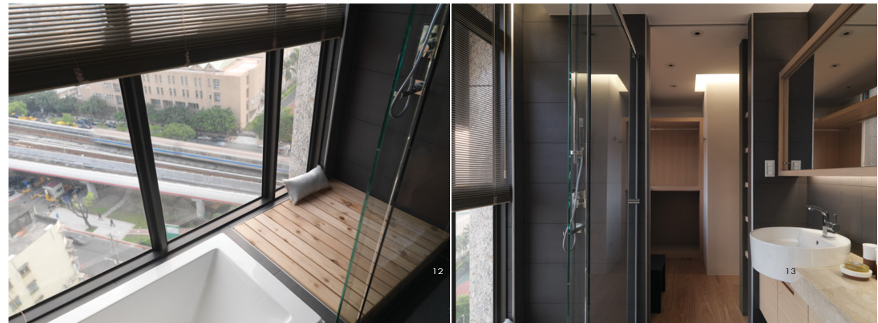
8. 全室以米白色與原木色作配搭，蘊釀雅致的和風氣息。9. 空間強調框景手法，深刻門框或線條勾勒框景。10. 現況圖。11. 平面圖。12. 取用湯屋元素規劃泡澡區，為生活添加情趣。13. 衛浴。 8. White color and wood furnishing provide a unmistakable Japanese air 9. Framed view indicates domestic intimacy 10. Existing plan 11. Plan after conversion 12. Elements taken from a hot spring hotel are used in the bathroom 13. Bathroom