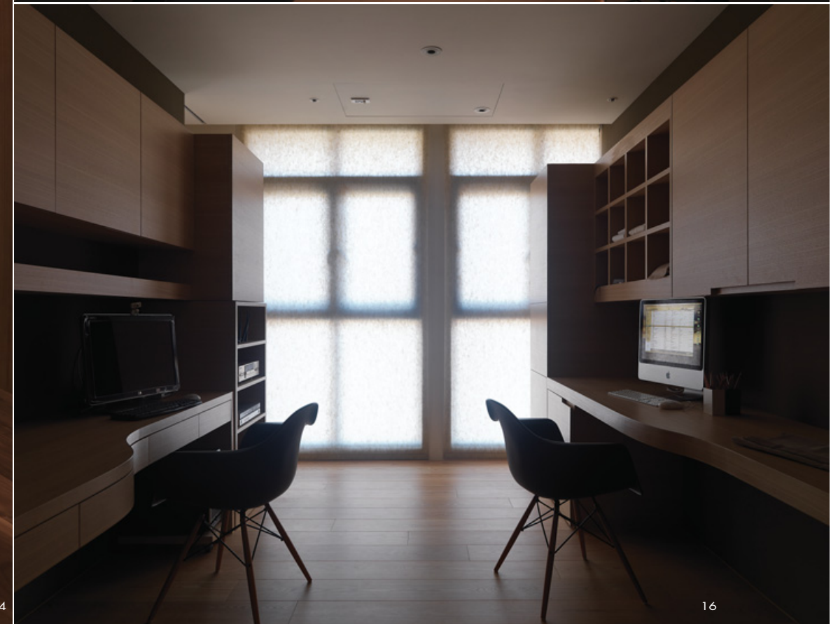
14. 書房利用隔扇拉門，讓使用者能自主調節開放尺度。15. 書房規劃兩座工作桌，讓男女主人能各自擁有工作平台。16. 書房桌椅高度與動線規劃均考量了使用者動作細節的舒適感。 14. Sliding door joins with a reading room 15. Two tables are installed in reading room 16. Considerate control of scale for fitting actual needs