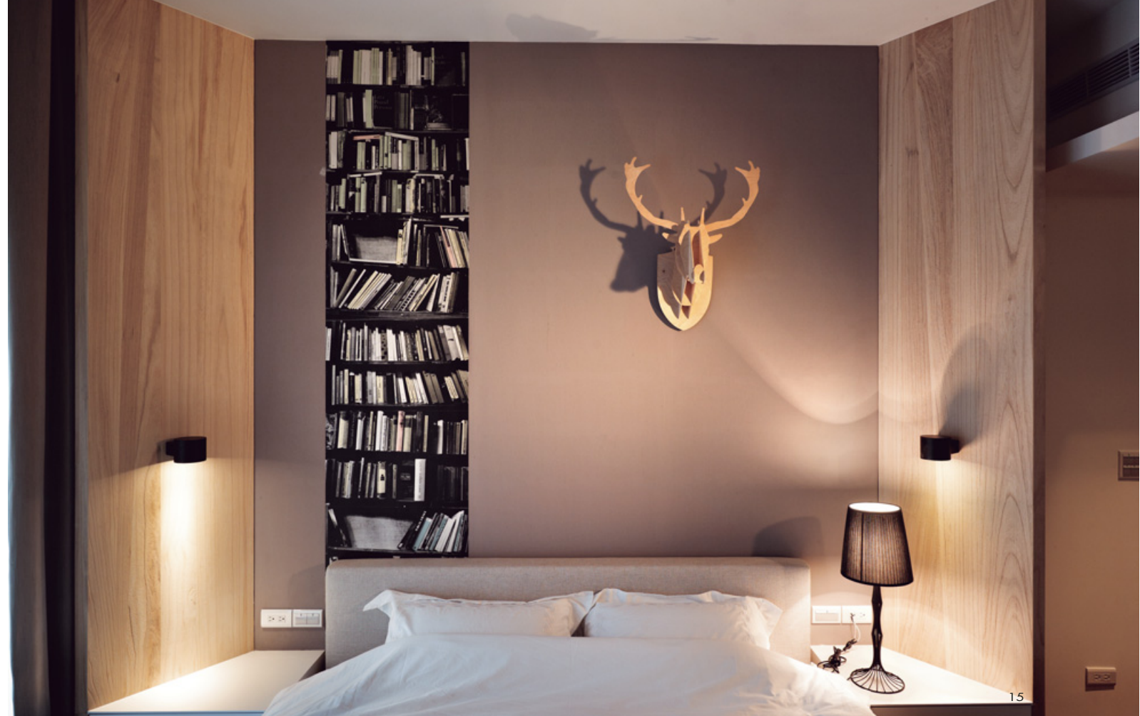
12. 書房。13.14. 通往臥房的動線，以一座半開放式書房連結公私領域。15. 主臥房。16.17. 衛浴。18. 更衣室。 12. Reading room 13.14.. Reading room that links the public and private zones 15. Master bedroom 16.17. Bathroom 18. Walk-in closet