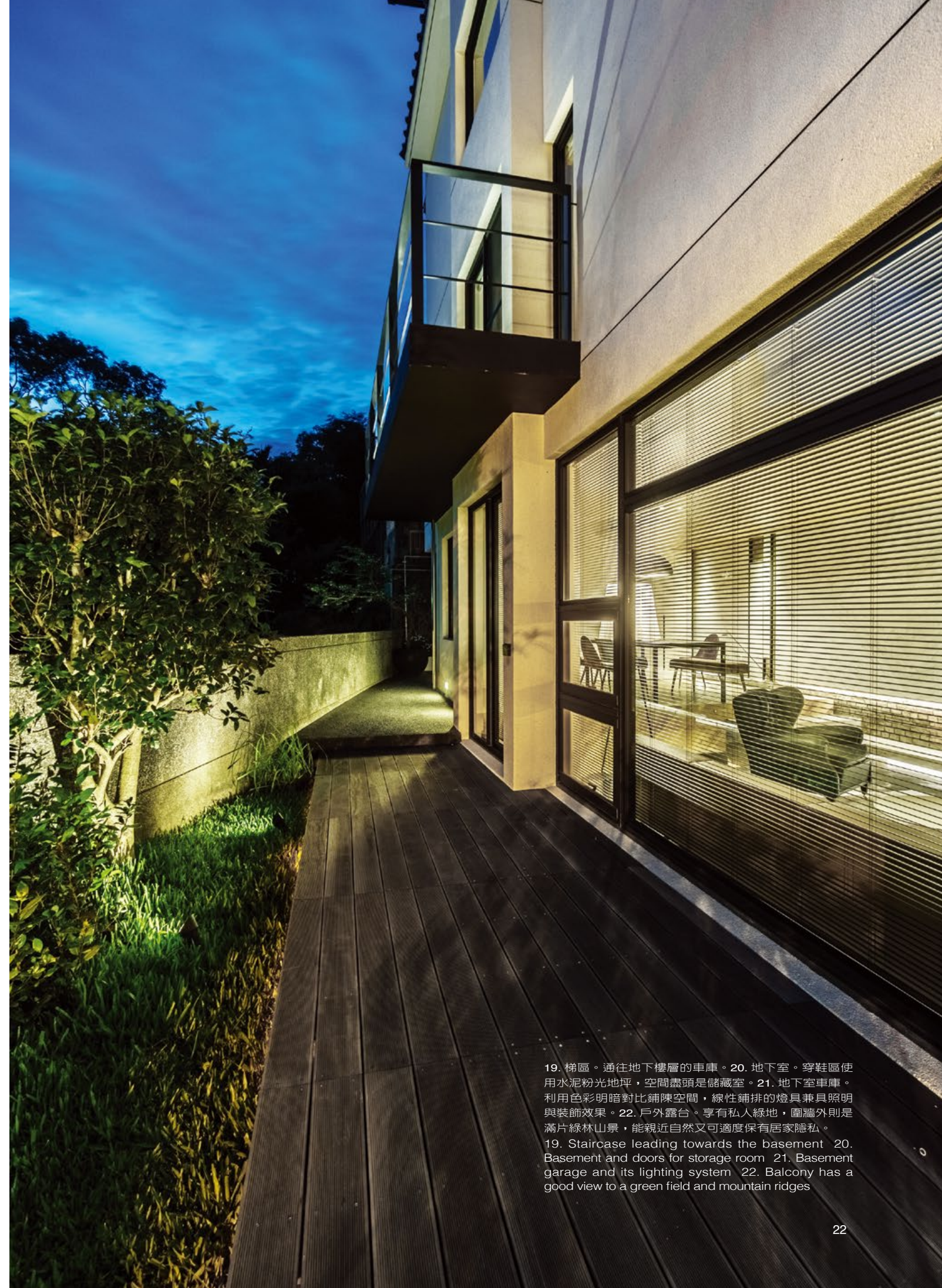
19. 梯區。通往地下樓層的車庫。20. 地下室。穿鞋區使用水泥粉光地坪，空間盡頭是儲藏室。21. 地下室車庫。利用色彩明暗對比鋪陳空間，線性鋪排的燈具兼具照明與裝飾效果。22. 戶外露台。享有私人綠地，圍牆外則是滿片綠林山景，能親近自然又可適度保有居家隱私。 19. Staircase leading towards the basement 20. Basement and doors for storage room 21. Basement garage and its lighting system 22. Balcony has a good view to a green field and mountain ridges