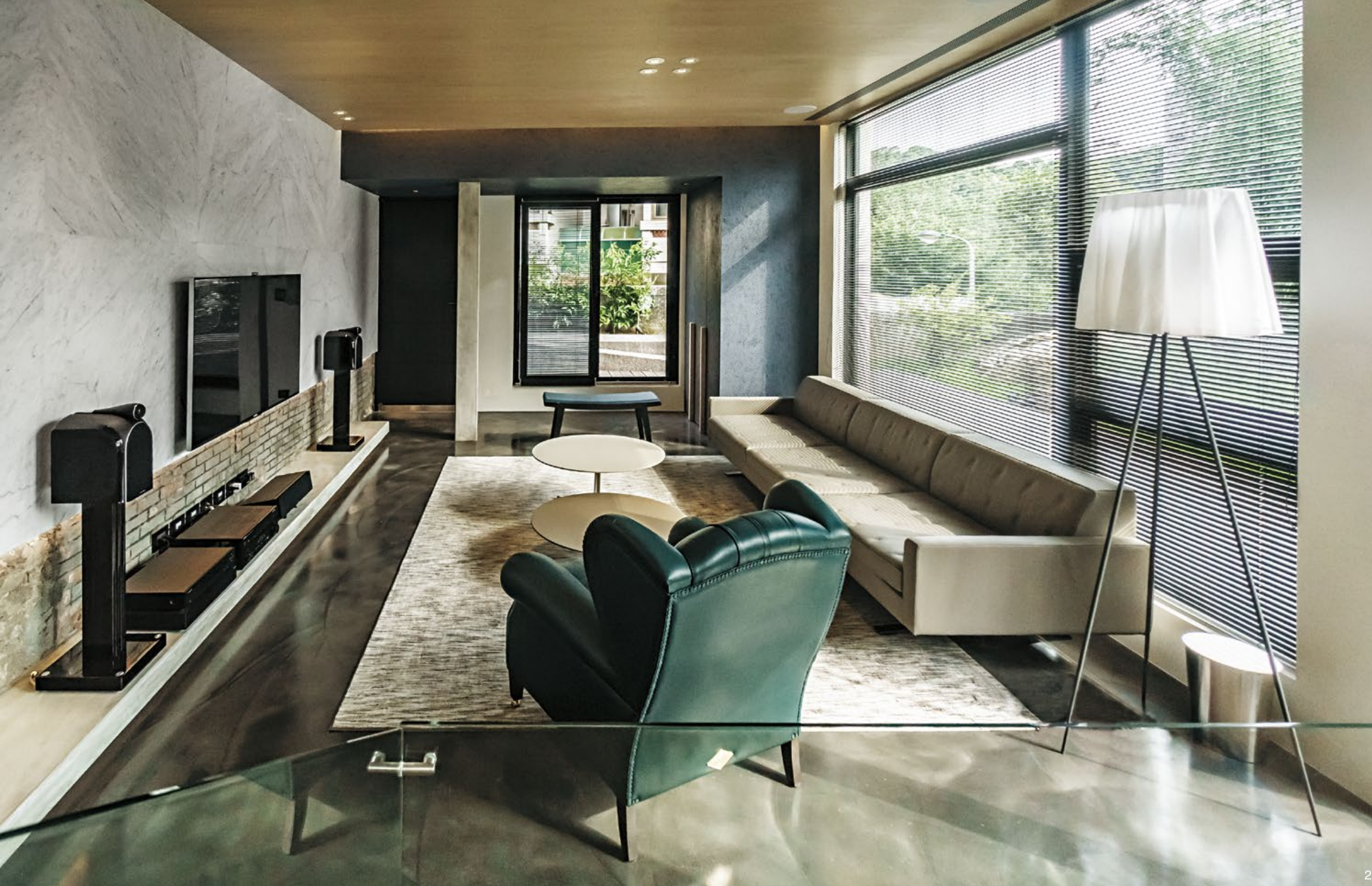
2. 客廳。藉由材料的反光或亞光效果捕捉光線變化，在明暗有秩的調配下，光照明亮卻不令人刺眼。3. 餐廳。位處一樓高處，以玻璃作為圍欄，視線暢通能俯瞰整座廳區以及連綿窗景。4. 廳區。將地坪原有的高度落差，消化在電視櫃與梯區之中。