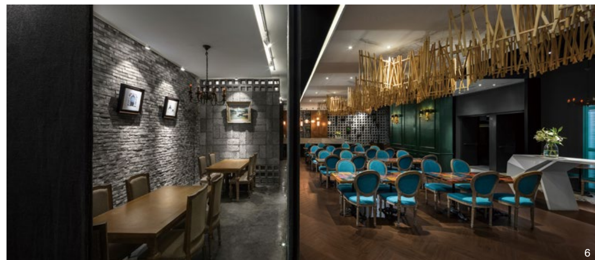
6. Box room is veiled by a black silk screen 7. Box room and its internal layout 8. Bamboo fixture dialogues with the tablecloth