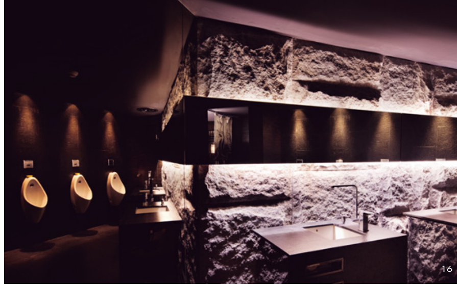
16. 男廁。17. 包廂的「緣側」規劃，讓賓客在進出廂房時能產生交流互動。18. 包廂區，樹木因背光而呈現剪影般的姿態，延續了反轉內外的趣味手法。19. 包廂利用手工和紙與單向暈光塑造詩意的內景。20. 包廂內部使用捲簾作彈性區隔。 16. Men's Room 17. Engawa space creates an ambiguous zone 18. VIP lounge and its interior furnishing 19. Japanese paper receives thin light from outside providing a poetic delight 20. Roll screen in box lounge