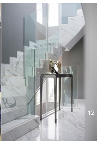
10. 以玻璃摺門輕輕劃開起居廳和書房，保持室內開闊的空間感。11. 起居廳，土黃色地毯上放置了寶藍色沙發，空間洋溢舒適氛圍，是屋主全家人共享的談心地點。12. 梯間，以香檳金隔柵將廳區和梯間分隔，空間佈局井然有序。13. 頂層天臺環抱遼闊景觀，視野暢朗。14. 頂層天臺配置戶外家具和燒烤爐，是舉行派對的理想空間。 10. Sliding glass door gently divides the family room and reading room 11. Living room floor is covered with an earthy color carpet and dominated by a grand sofa in blue color 12. Staircase lobby is converted into storage space 13. Balcony enjoys exceptional view 14. Balcony furniture pieces and B.B.Q grill oven