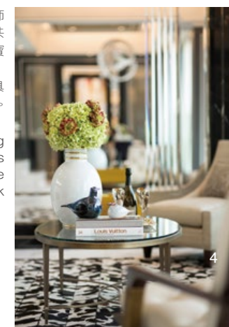
2. 客廳以深暖灰色作主調，主牆飾有簡約的裝飾線條，配搭雅致的壁燈、藝術畫和雲石壁爐，共同營造瑰麗氣氛。3. 餐廳中央擺放長型餐桌與寶藍色餐椅，天花板配掛了環狀 Preciosa 水晶燈，整體氣派華麗。4. 柔美的燈光灑落在 Baker 家具上，在馬毛地毯的烘托中，大廳鋪襯出絲絲貴氣。5. 餐椅採用寶藍色系展現優雅內斂的風格。 2. Gray color sets the main tone of the living room 3. Central Preciosa chandelier dominates the sight in the dining room 4. Baker furniture pieces are illuminated by gentle light 5. Dark blue color dining chairs