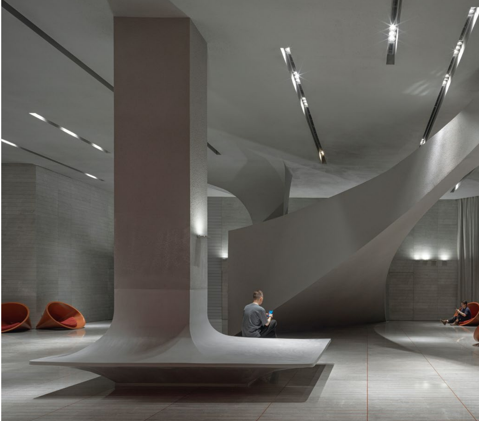
2. 地坪以橙色線條強調曲面造型的縱向延伸感。3. 主要光源隱藏於天花板之中，並以向上光源打亮造型。4. 櫃台曲面螢幕與對向曲牆於平面上形塑喇叭狀動線。