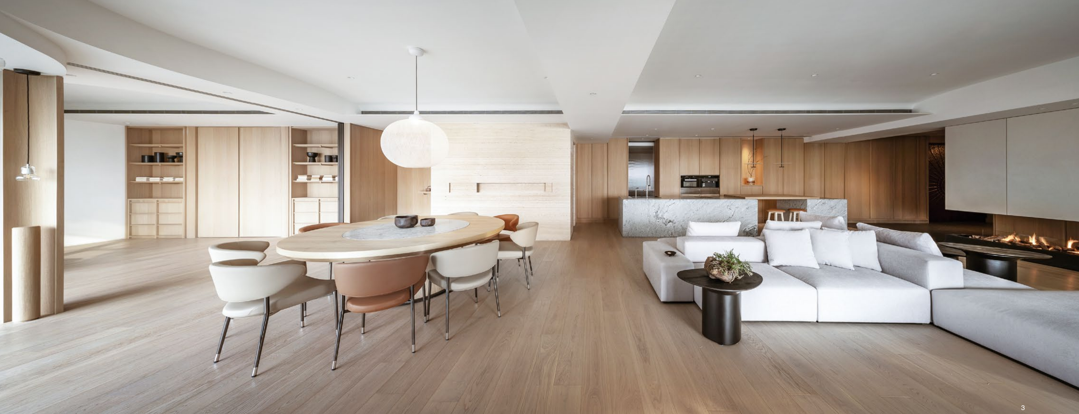
3. 具靈活性的家具，構築隨處可休憩的情境，使各處皆能賞景迎光。4. 將外部的設計語彙延伸進茶室，牆體的分割強化了韻律性。