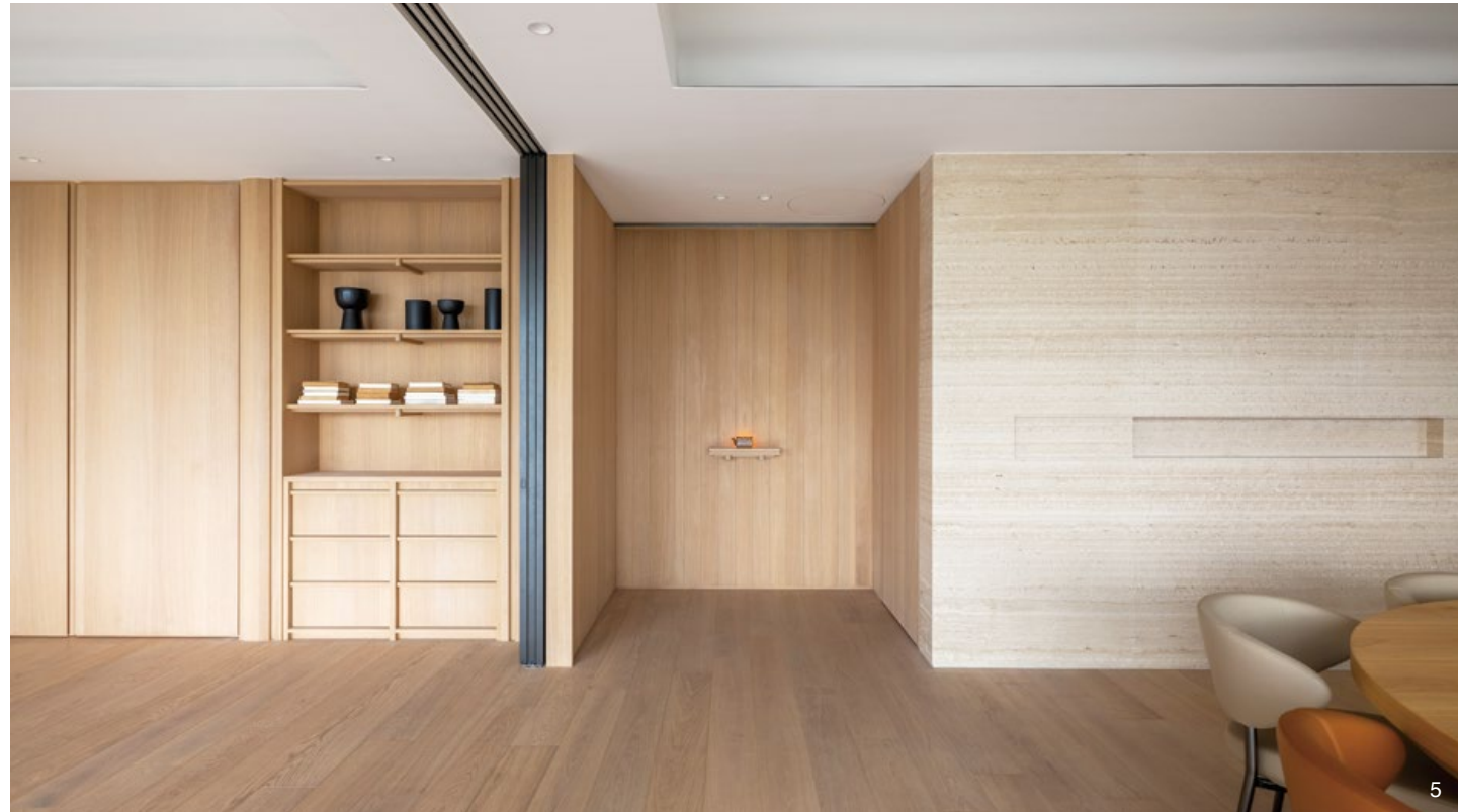
5. 空間中的所有節點，皆佐以精緻的設計細節，豐厚層次。6. 天花板的曲線轉折順應著河道和建築型態，室內外相映成趣。7. 纖細立柱將格柵拉門俐落收起，輕質化的量體不過度遮擋景色，亦可作為端景展示。 5. Exquisite design details and rich layering throughout the space. 6. The curve of the ceiling plane conforms to the river channel and the building shape as the interior design echoes the exterior appearance. 7. The slim column neatly conceals the sliding doors, and the lightweight volume does not block the view so it presents itself as an object in display.