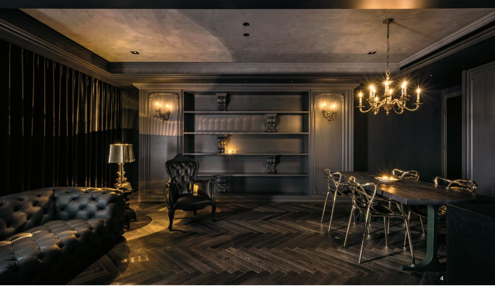
4. 深灰色空間運用金色選件與細節,讓色調在受光下的反差,加乘整體視覺張力。5. 平面圖。6. 運用各種物料質感的差異經營深淺有別的墨灰變化。7. 餐桌也是工作桌,可作為接待與會議之用。

This is an art creator's home. The owner hoped the space would focus on expounding a personal inner ideal that is not limited by daily life practical considerations but rather focus on expounding personal inner ideals. With a reciprocated artistic understanding with the designer, they decided to create the design together, so it reflected the rich inner artistic characteristics of the homeowner.