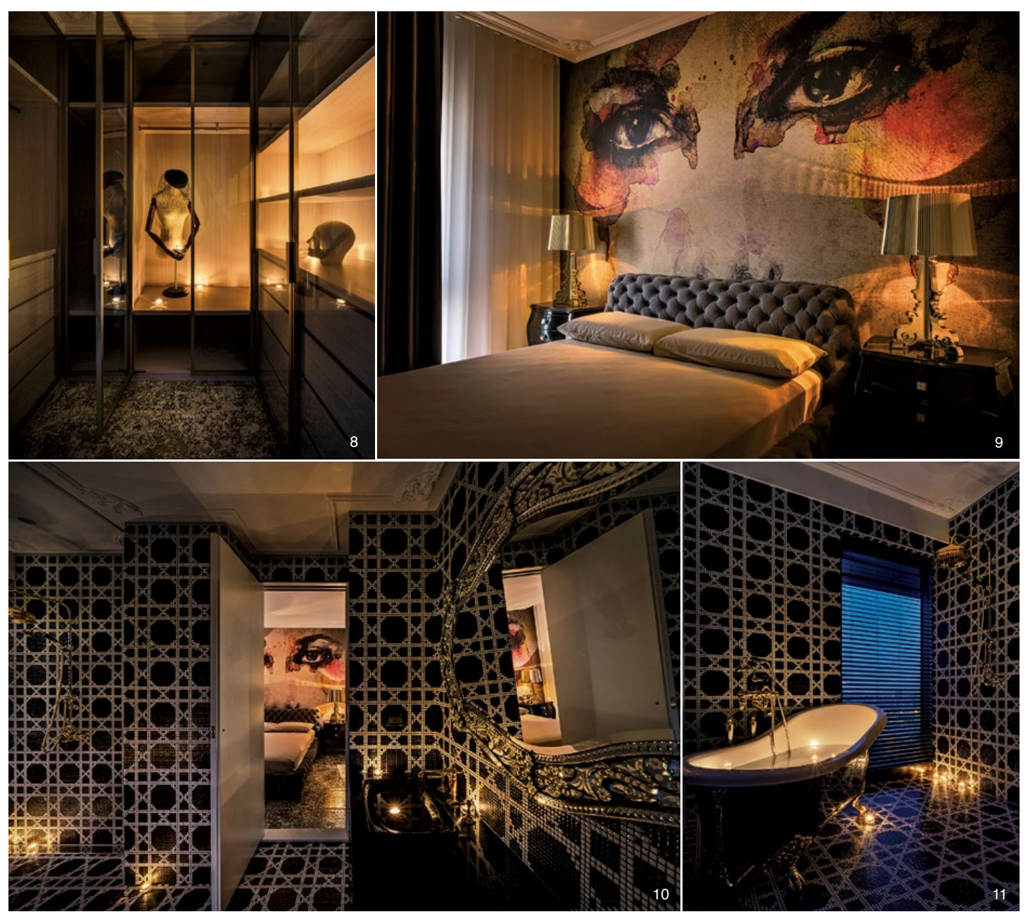
8. 更衣室櫃區採用鍍鈦框與強化玻璃,提升整體精緻度。9. 主臥主牆貼覆藝術壁紙,傳達屋主背景特質。10. 主臥衛浴以 BISAZZA 的 FLOORING 馬賽克為空間編織黑白幾何線條,突顯時尚個性。11. 淋浴區與泡澡區不加分隔,維繫整體通透感。12.FLOORING 馬賽克鋪覆於地面與立面,構成一體成型的效果。