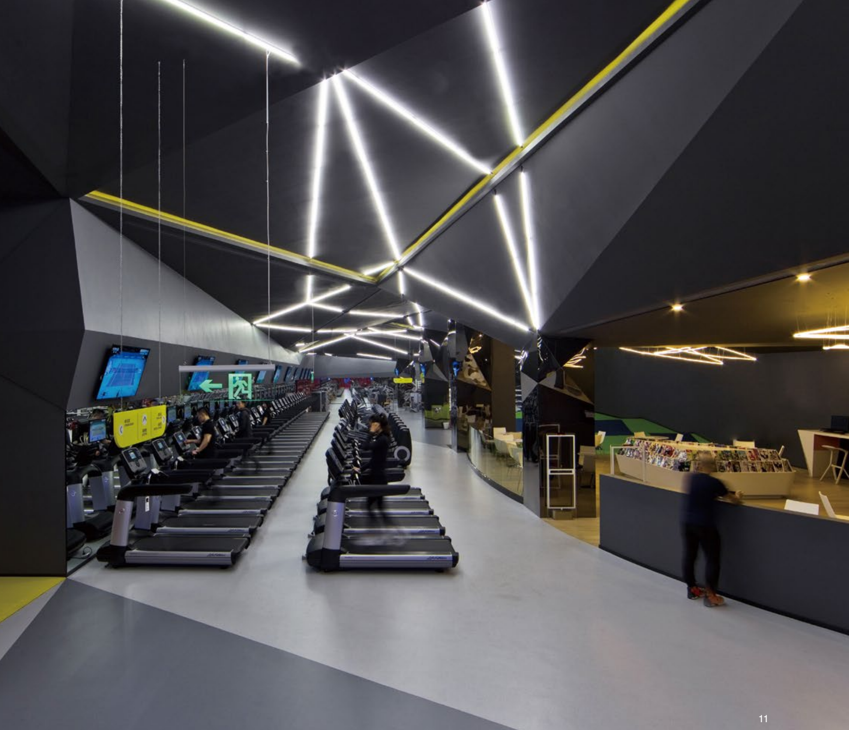
8. 光帶、投影、音樂等，構成了活力十足的運動節奏。9. 地面以黃色和白色圓形符號作為引導。10.11. 開放型態的健身區域。12. 化妝間，延續起伏結構，由地板、牆面，到天花板。13. 收納衣物區。