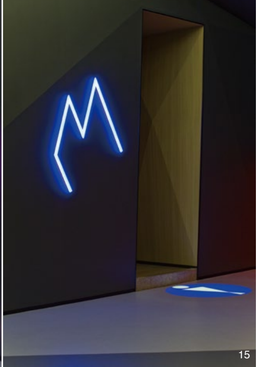
14. 女化妝間。15. 男化妝間。16. 休憩區，延續螢光紅色的氛圍。17. 瑜珈區域，螢光綠與藍，特意製造的活潑氣息。