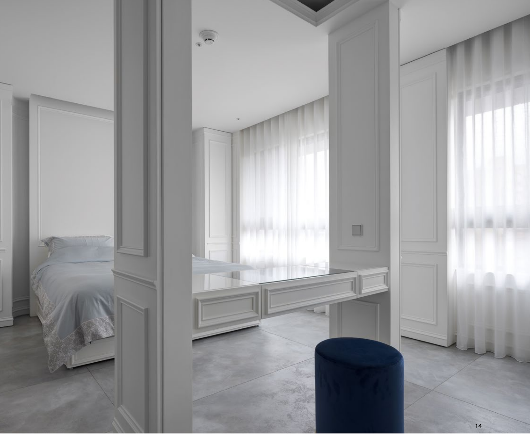
10. Bathroom space, textured quartz tile wall and floor, clean simple finish. 11. Master bedroom with generous storage and handbag display space that is hidden behind the stainless steel mirror finish doors. The mirror panels reduce the pressure of the walkway, while creating a boundary at the same time obscuring the public/private transition 12. Master bathroom. 13. The Jewelry display case in the master bedroom. Integrated H-shape screen also defines the separation between the sleeping and dressing spaces. 14. All major functionality within the master bedroom were requested to be hidden, only the necessary furniture is visible as a symbol of the perfection of comfort. This allows the sleeping itself as a kind of display.