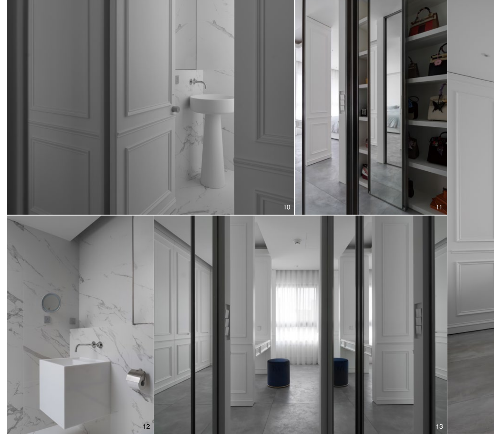
10. 衛浴空間,石英磚鋪覆立面與地坪,畫面簡潔卻自具紋理筆觸。11. 主臥房規劃充裕的儲衣、包包展示空間,以不鏽鋼框鏡門隱藏,打開可展示屋主收藏,關起時鏡面能減輕走道的壓迫感,同時創造一個邊界及尺度模糊的公 / 私轉換空間。12. 主臥房衛浴。13. 主臥房飾品展示桌整合成 H 型裝置,看似一座屏風,也是睡寢與更衣之間的分界點。14. 主臥房將所有功能需求隱藏,視覺上只留下舒適的空間感以及必要家具,讓睡眠本身也是美麗的展示。

Within the quiet warm white background, adding gray quartz tiles with organic irregular patterns that manifest as an oil painting style texture enhance the white, gray and block tonal contrast. The lighting scheme mainly uses indirect light sources for the ambient and serene character, with incidental focal recessed fixtures, floor lamps, or chandeliers, to balance the overall spatial hierarchy and to enrich the space's angelic atmosphere.