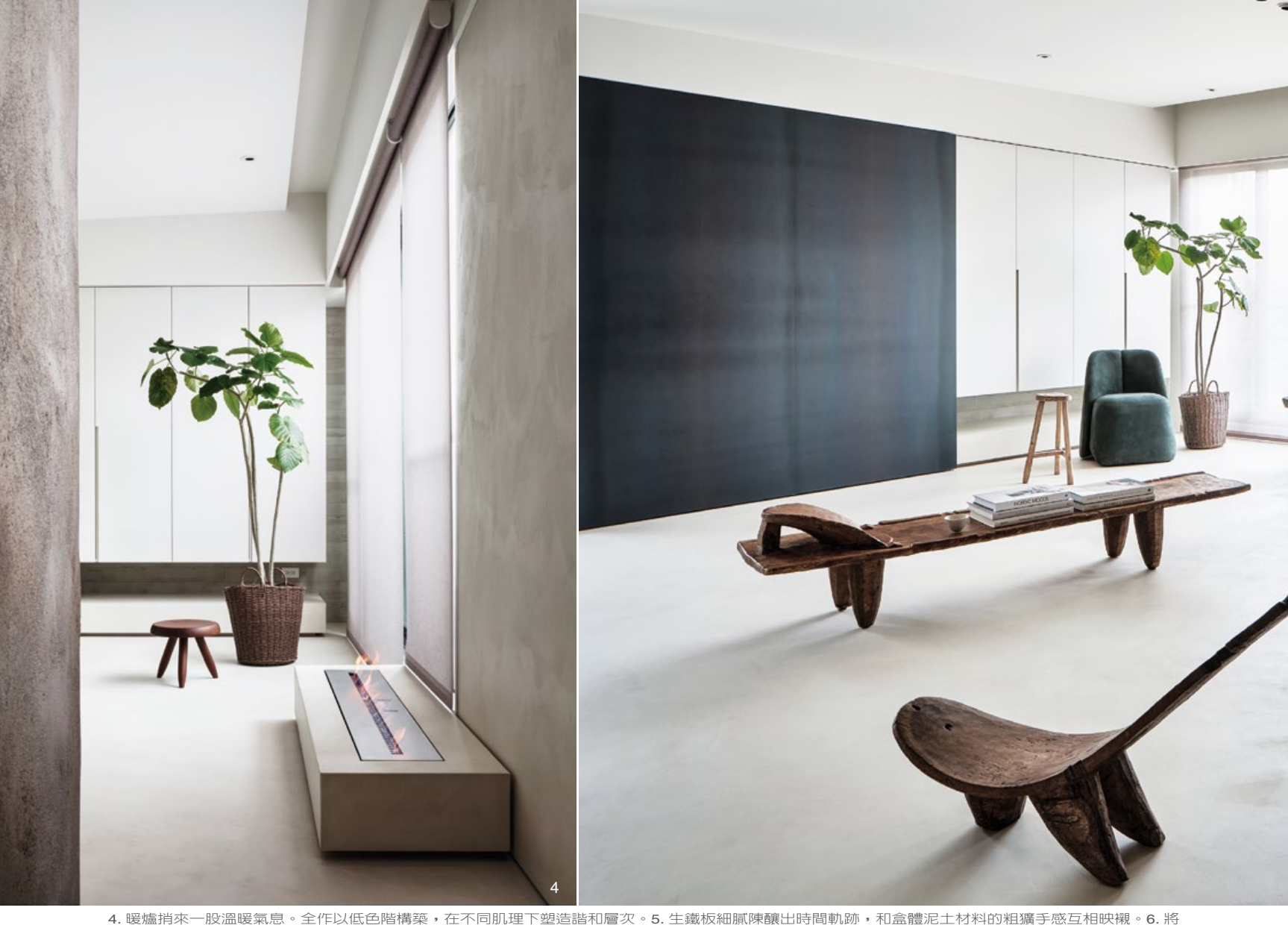
4. 暖爐捎來一股溫暖氣息。全作以低色階構築,在不同肌理下塑造諧和層次。5. 生鐵板細膩陳釀出時間軌跡,和盒體泥土材料的粗獷手感互相映襯。6. 將量體切斜角,弱化銳度;微小燈光被布局在凹洞中,淡淡的暈光具指引作用。

方信原進一步解釋道,開闊的感受,可分為「視覺實際的穿透」,與「感受性的穿透」,這兩大面向皆成為實穿全作的設計概念。綜觀整體布局,除既定機能外,另配置了女主人的珠寶工作站,以及一間多功能室,預留日後作為兒童房使用的彈性,兩者之間以一座可陳列珠寶材料、成品的層架做出無形劃分,再以活動摺門滿足開放隱私的轉換;串起客廳、餐廳及多功能室的斜對角軸線,也因為摺門的運用使得三個空間一氣呵成,形成實際的視覺通透。而主臥室、主臥衛浴、客用衛浴乃至多功能空間,此一軸線上的空間隔牆均以210公分作為基準線,透過結構頂層的開放連動,使得肩負區劃機能的隔牆依舊保有視線的流動,在虛實交錯之間探索場域邊界的自由,延展居住者的體感;設計師分享,由於私密的衛浴空間與餐廳相互比鄰,原先曾考慮此道結構牆是否需增添可阻絕聲音氣味的隔斷材質,不過最終屋主仍決議維持所有隔間的穿透,藉此突顯採光優勢,也讓光線漫射成為本作匠心獨具的意蘊。