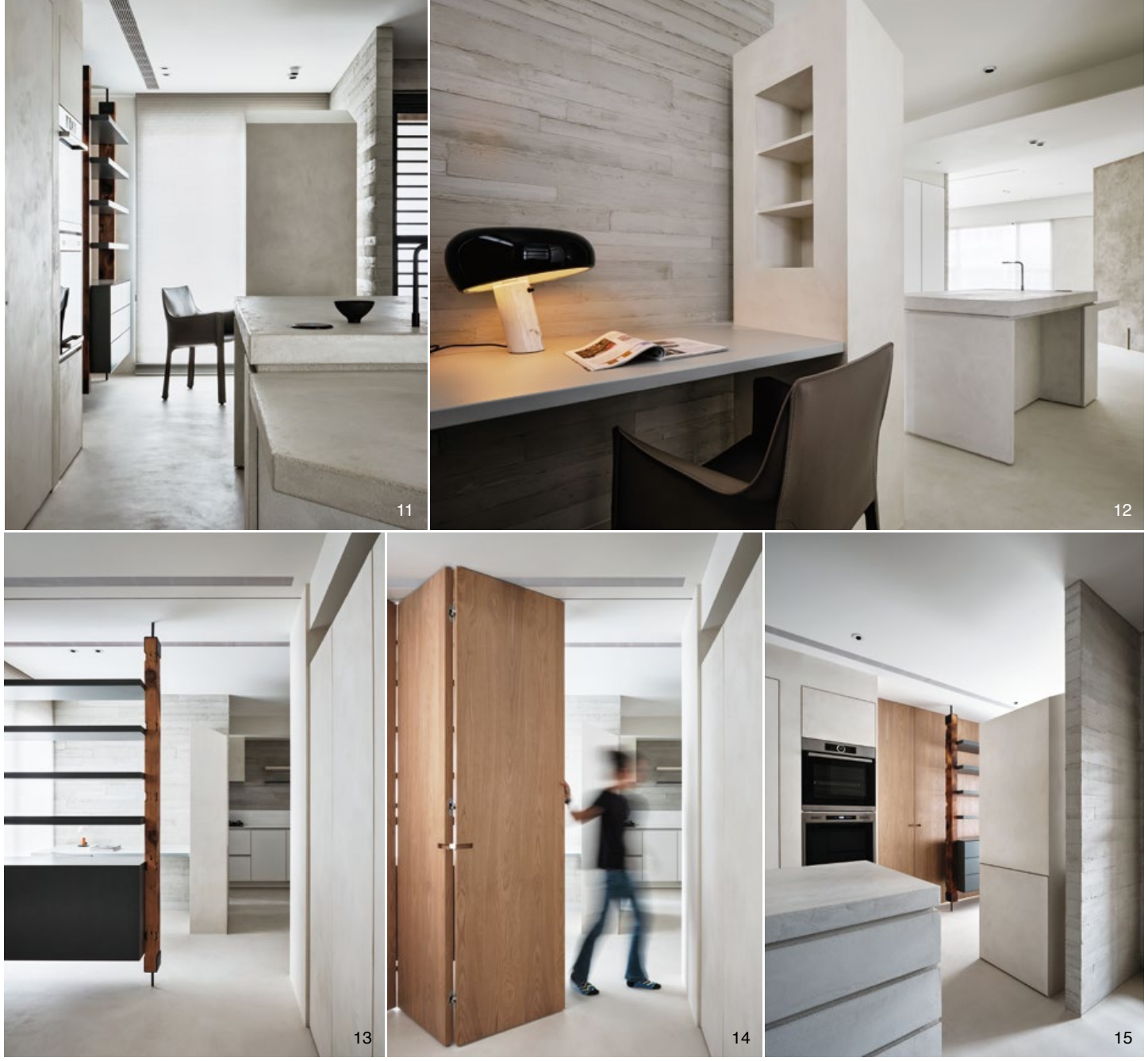
11. 女主人的珠寶工作站。透過結構體與餐廚區、多功能室無形劃出區隔。12. 右側結構在區隔場域之餘,也身兼兩側的置物機能。13. 老木作為書架的主要支點結構,貼合屋主喜愛的純樸韻致。14.15. 活動摺疊門的運用維持了隱私跟開放的彈性。16. 不到頂的結構不僅創造了視線的流動,也滿足了光線的恣意游移。17. 主臥衛浴。主要以塗料構築。18.19. 利用玻璃作為睡眠環境與衛浴空間的隔斷。