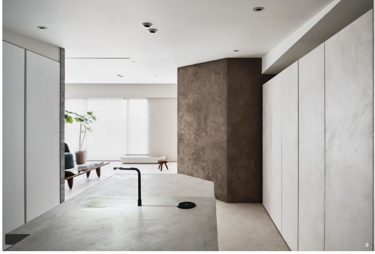
7. 中島漂台與餐桌同樣打了斜角,扣合盒體形式。8. 量體收整了空間畫面,與旁邊櫃體脫開,細緻疊加雕塑感。9. 從客廳向内看的斜對角軸線穿透無阻,顯現設計者及屋主對於開闊的追求。10. 主臥、主臥衛浴、客用衛浴的空間軸線皆以 210 公分為基準線,結構頂層的開放流動,形塑了視覺和感覺的開闊。7. The free-standing island counter has the same beveled details as the dining table. 8. The volume reorganized the spatial perception with meticulous detailing that conveys a sculptural quality. 9. The diagonal axis from the living room penetrates unimpeded displaying the design and the owner's pursuit of openness. 10. A consistent datum at 210 cm above finish floor provides the openness above that allows light and vision to flow throughout the space.

also be used as a child's room in the future. A diagonal axis of living room, dining room and multi-purpose room are strung together, and the use of folding doors form an actual visual transparency. The master bedroom, master bedroom bathroom,